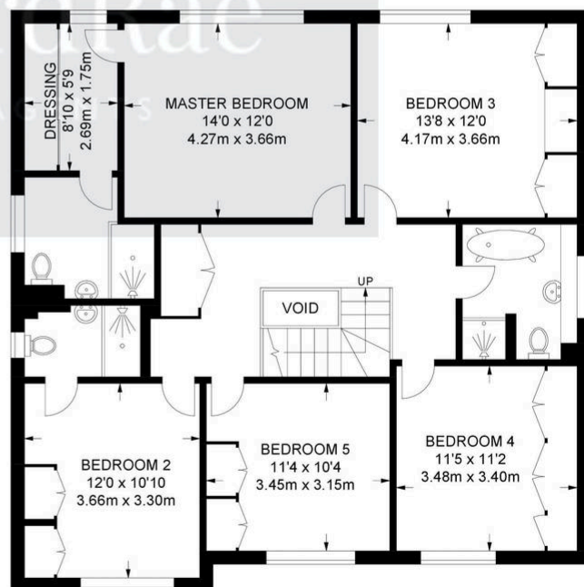
FIRST FLOOR 1132 SQ FT / 105.2 SQ M

APPROXIMATE GROSS INTERNAL AREA : 2340 SQ FT / 217.4 SQ M TOTAL AREA (INCLUDING OUTBUILDING) : 2470 SQ FT / 229.5 SQ M